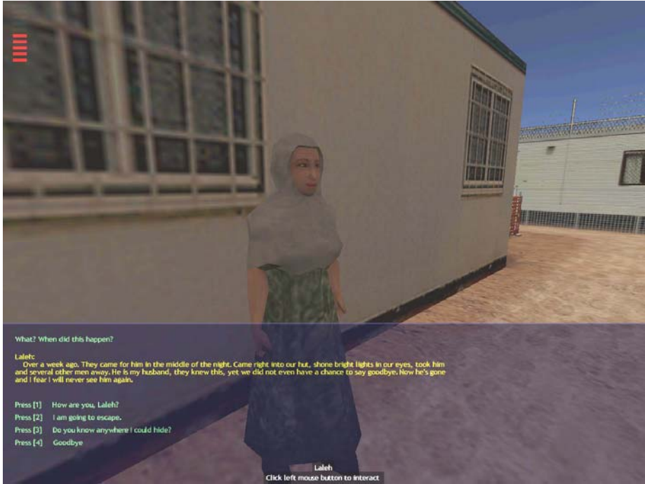
Figure 6 Escape From Woomera Collective; Escape From Woomera; Laleh.