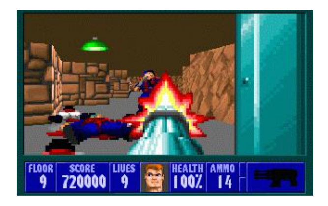
Figure 2 An original Wolfenstein 3D screen

knowing where he is or what he is doing, is dying over and over again, killed by some unseen force that shouts at him in digitised German.