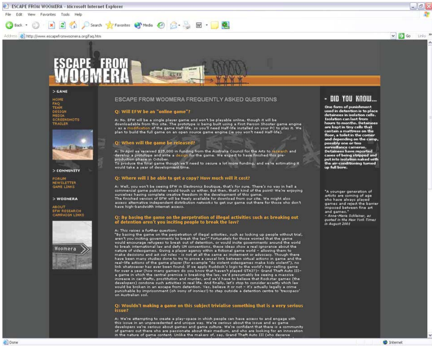
Figure 4 Escape From Woomera Collective; Escape From Woomera website.

Their opening page has a news section in the middle column and with every page change to another section of the site; facts pop up on the right hand column about the Australian detention centres. The left-hand side of the page provides navigation to the other areas of the site. The navigation side of the site is divided into three sections, each dealing with different aspects of Woomera. The first is the GAME, which holds the titles of HOME, FAQ, TEAM, DESIGN, MEDIA, SCREENSHOTS and TRAILER. The next section is COMMUNITY, which holds links to the FORUM and GAME LINKS as well as a NEWSLETTER link. The last section is WOOMERA, which apart from an ABOUT section, includes all the political CAMPAIGN LINKS, including an interesting section titled EFW RESEARCH. These research files include all the various facts about Woomera that are displayed on the right-hand side of the page throughout navigation. Many of these are facts about life within the detention centres such as the kinds of anti-depressants prescribed and the fact that family photographs are not officially allowed and are confiscated.